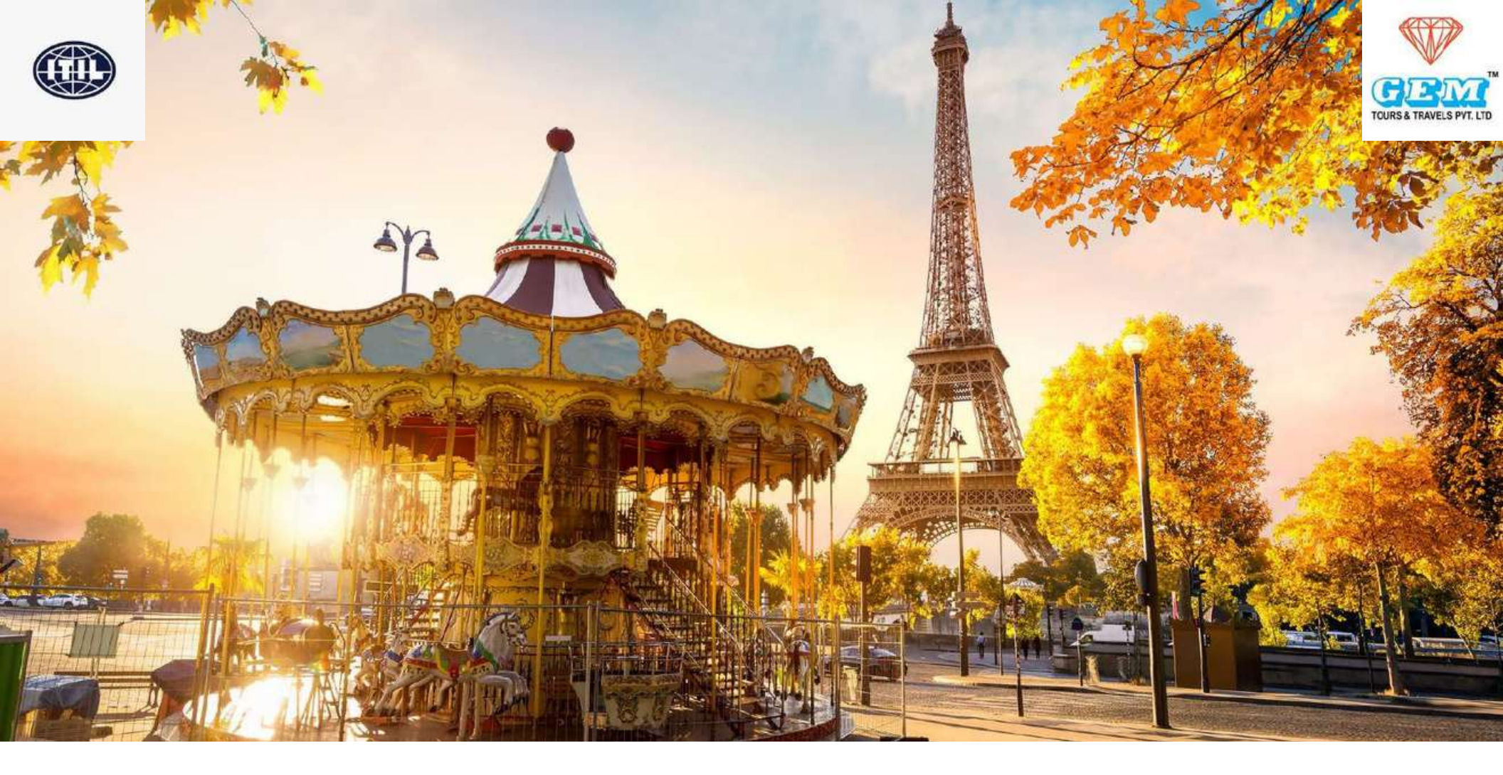
DAY 9: DISNEYLAND

After breakfast depart for a full day excursion of Disney Land. Fantasy is reality in Disneyland Park, where classic Disney tales and Star Wars legends are brought to life like nowhere else. You have an option to choose between Disney Land and Disney Studio. Depart from Disney Land in the evening, Dinner in Indian restaurant and overnight in Paris. (Meals: Breakfast, Lunch, Dinner)